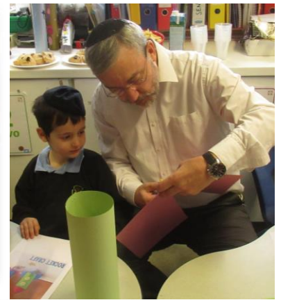
My Family Tree